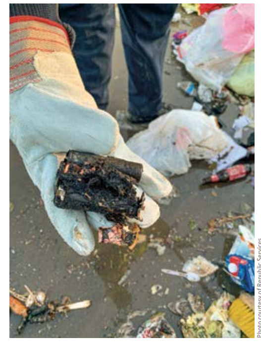
This lithium-ion battery pack was most likely to blame for a fire in a trash collection truck that required the load to be emptied onto a street so the fire could be put out.

We can all do our part to ensure we properly dispose of these batteries to keep our community safe.