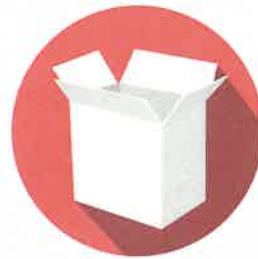
Flattened Cardboard Boxes