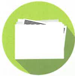
File Folders, Office Paper, Envelopes