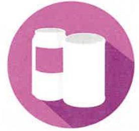
Aluminum, Tin, & Other Metal Cans