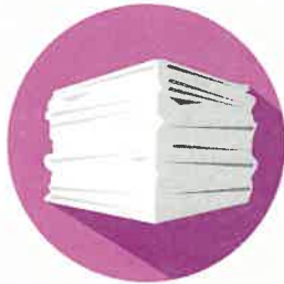
Newspapers, Catalogs, Phone Books, Paper Bags