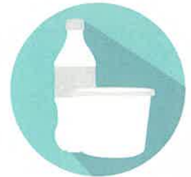
Plastic Bottles, Tub, Containers & Trays #1 - #7 excluding #6