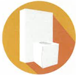
Paperboard Boxes - Cereal, Tissue & Frozen Food Boxes