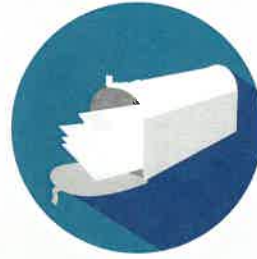
Junk Mail, Glossy Paper, Magazines