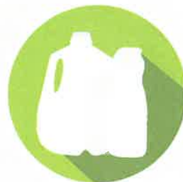
Plastic Jugs & Containers #1 - #7 excluding #6